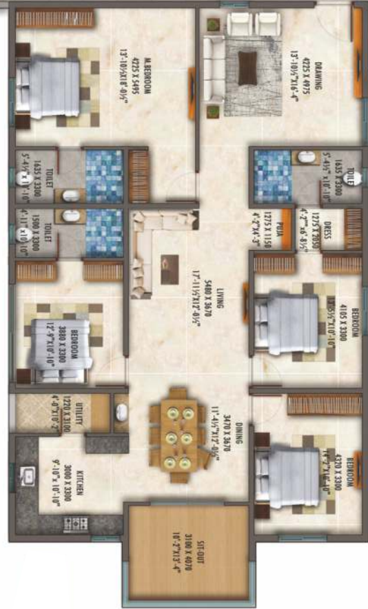
4 West Flat Area: 2700