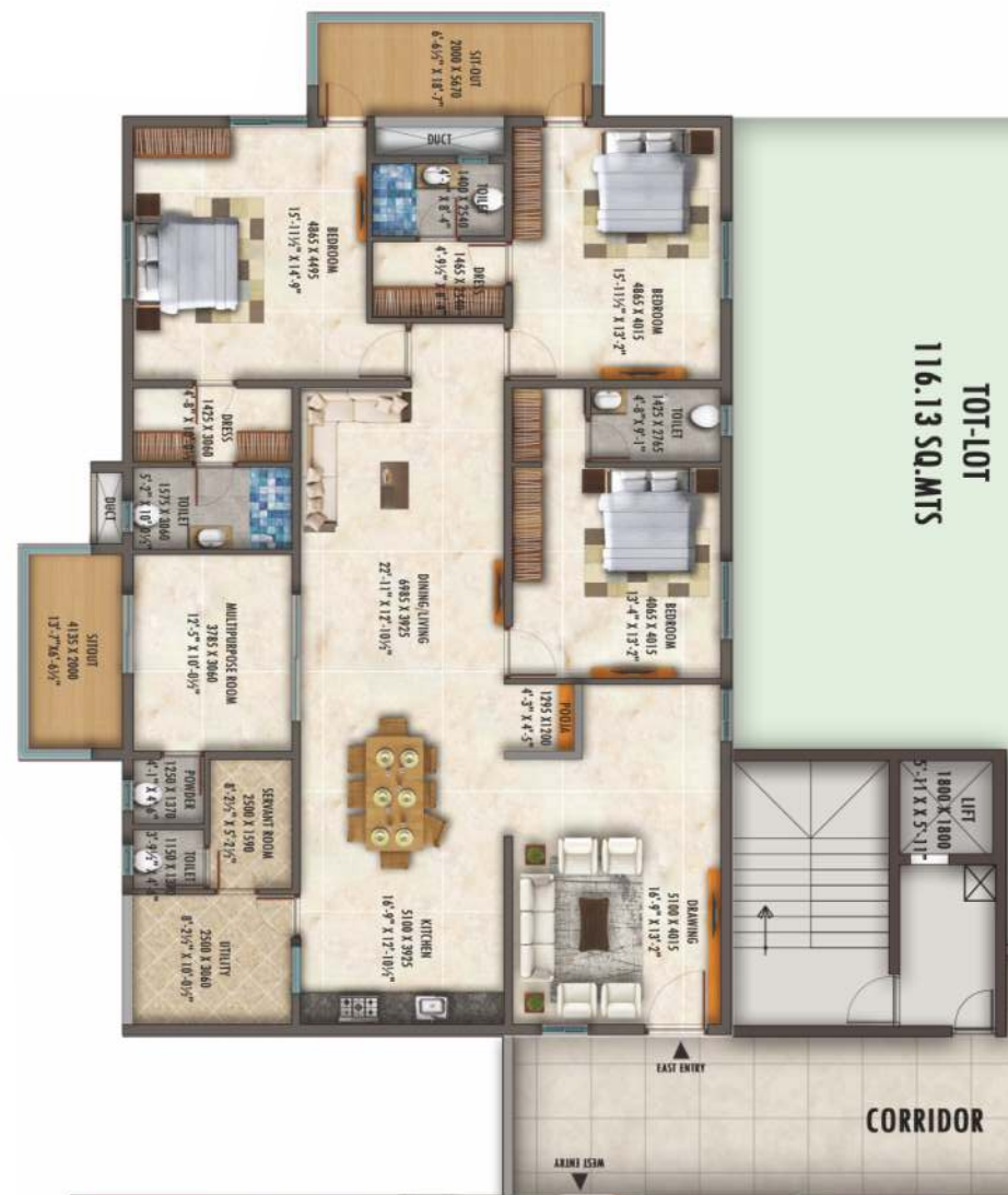
1 East Flat Area: 3200