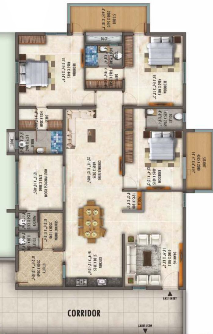
7 East Flat Area: 3200