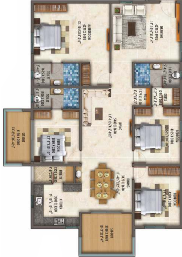
2 West Flat Area: 2800