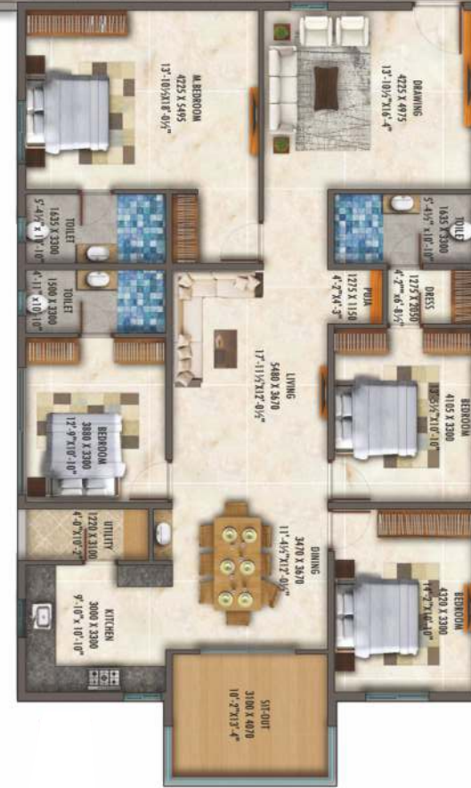
8 West Flat Area: 2700