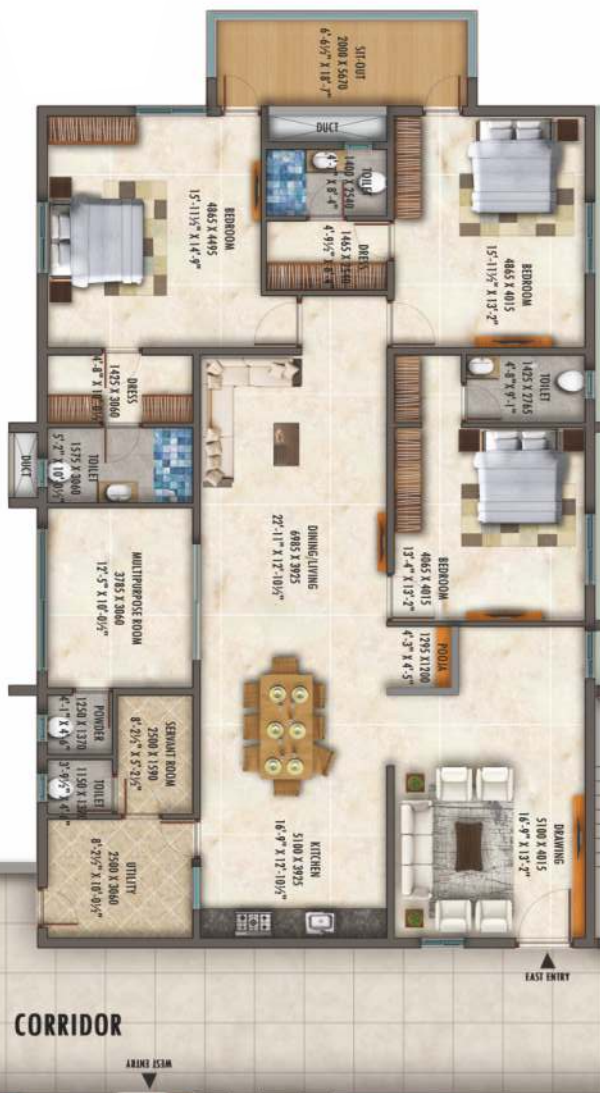
5 East Flat Area: 3100