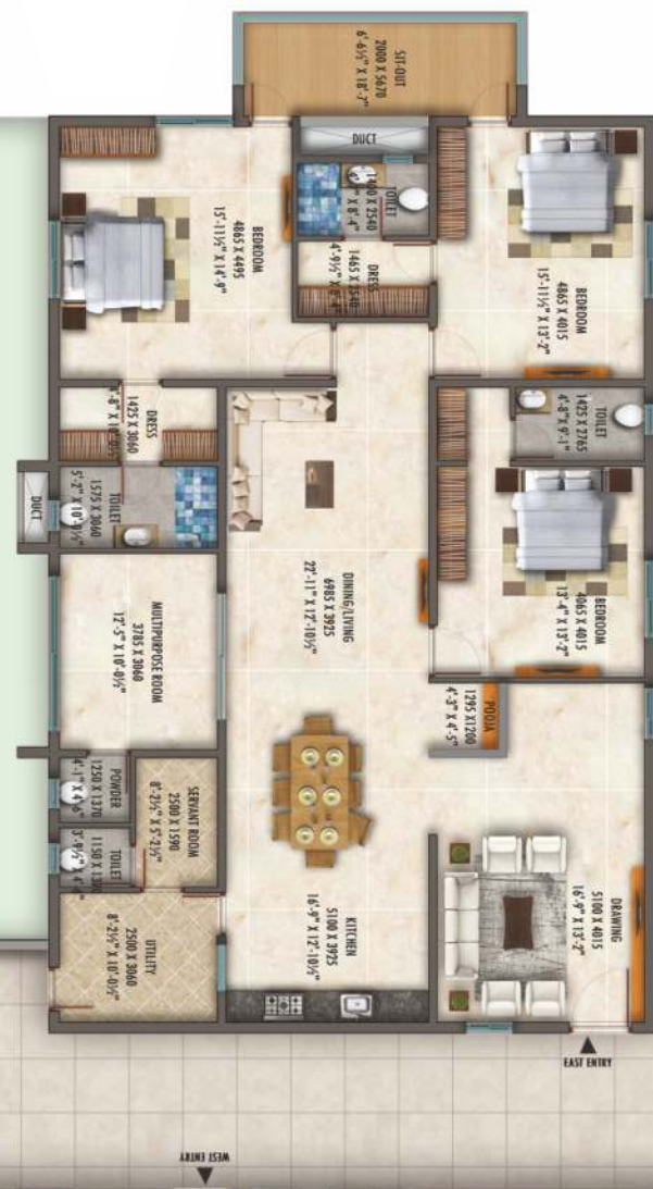
3 East Flat Area: 3100